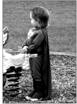
No Tinman? Maybe the Man of Steel will do.