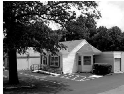
Berry Hill Community Center