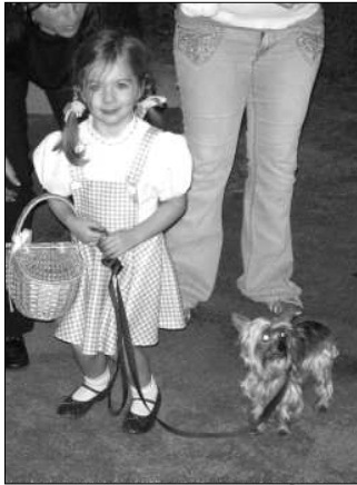
Dorothy & Toto – ✓