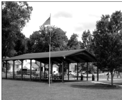
Azalea Park Shelter

The Azalea Park picnic shelter and the Berry Hill Community Center may be reserved for noncommercial purposes. Berry Hill residents and businesses may reserve on a first come/first served basis up to one year in advance. Nonresidents may reserve on a first come/first served basis up to one month in advance. There is no charge for using the facilities if you clean up after your event.