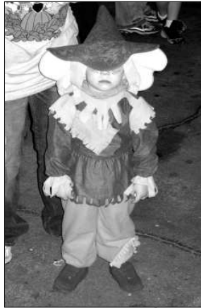
Scarecrow – ✓