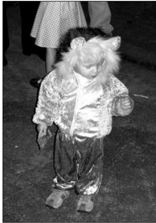
Lion – ✓